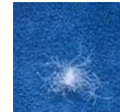
White Goose Down

Shell: 366+ Thread Count Super Fine Swiss Batiste